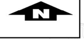
Widnes Town Centre Inset

Date: 08/03/2019 Approximate Scale: 1:13,750 @ A0 © Crown copyright and database rights 2018 Ordnance Survey 100018552